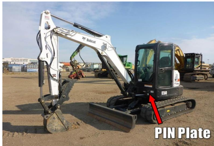
Bobcat E50 Excavator

Pictured are examples of similar model machines to the involved units.