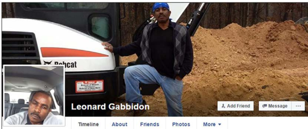
Image below from a social media site is confirmed to be the subject.

The subject may be traveling in a 2012 white Ford F-150, South Carolina plate DU4315.